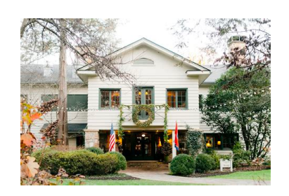
1406 Wilkinson Pike Maryville, TN 37803